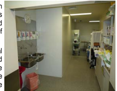
View from OR 5 showing temporary hoarding

The project will see an additional Operating Room constructed adjacent to and integrated with the current Operating Suite. The additional operating room will have a fully integrated suite and be equipped as a general operating