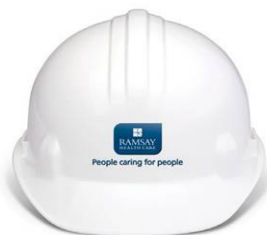
Hard Hats must be worn throughout the construction site

Following successful removal of asbestos from the construction site in mid November, air samples have confirmed that the process was an outstanding success, with concentrations of airborne asbestos particles registering at the lowest level recordable and within the acceptable range.